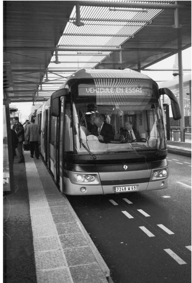
Figure 10. Irisbus Cavis vehicle used in Rouen.

Floor Height. An increasing number of systems operate low-floor vehicles to make passenger boarding and alighting easier. Buses in Bogotá, Curitiba, and Quito have high-platform boarding and alighting. Although these vehicles reduce passenger service times, their operation is limited to the BRT lines with high-platform stations. This dramatically reduces their operating flexibility.