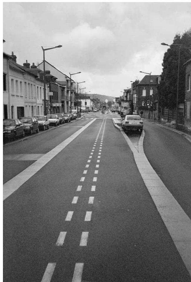
Figure 11. Bus lanes in Rouen.

Rights-of-way for busways should be purchased or reserved as early as possible. Alignments that may pose barriers to