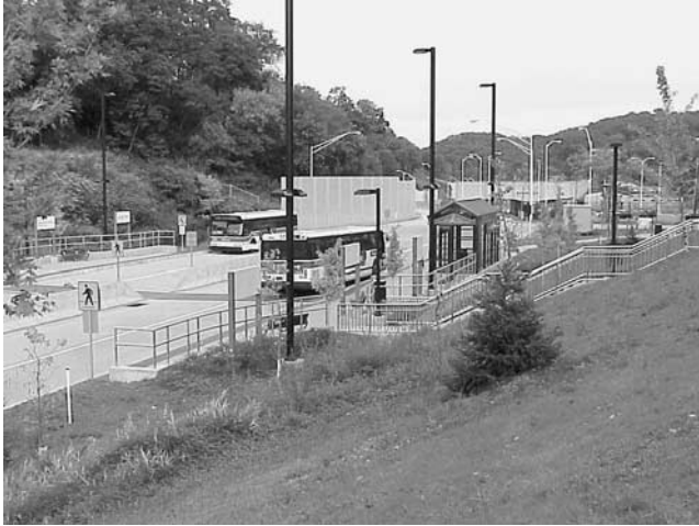
Figure 2. West Busway, Pittsburgh.

Figure 3 shows the typical median busway design used in South American cities.