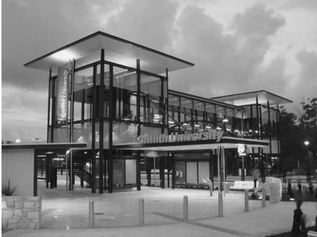
Figure 8. South East Busway station, Brisbane.

Body Style. Vehicle body styles include the standard (40-foot) bus, articulated (60-foot) buses, and, in Curitiba, bi-articulated buses. Some double-deck buses operate in Leeds, and Houston’s BRT service uses over-the-road intercity coaches. It is important to note that almost every city cited in the United States and Canada, except Los Angeles and Vancouver, operates or will operate articulated vehicles. Figure 9 shows the dual-mode articulated bus that will be used in Boston’s South Pier Transitway. Rouen, Boston, and Cleveland operate or plan to operate special BRT vehicles rather than conventional buses.