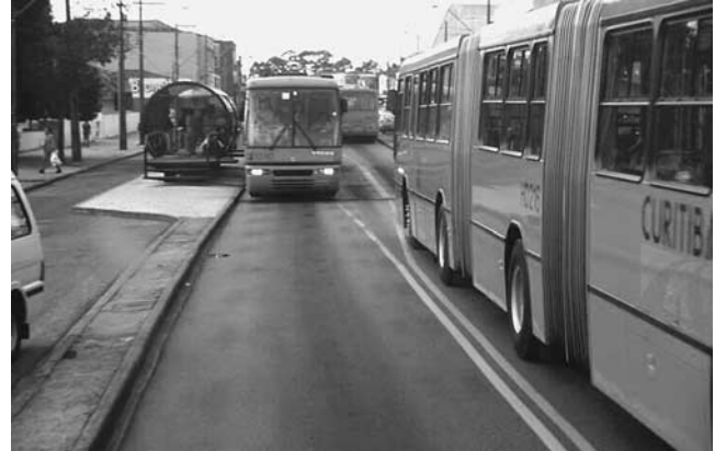
Figure 6. Bi-articulated bus median, Curitiba.

location, climate, type of facility, and available space. Some are simple, attractive canopies, as can be seen along the South Miami–Dade Busway or Los Angeles’s Metro Rapid lines, shown in Figure 7. Others, such as those along Brisbane’s South East Busway, provide distinct and architecturally distinguished designs, as well as a full range of pedestrian facilities and conveniences, as shown in Figure 8. The “high-platform” stations in Bogotá, Curitiba, and Quito contain extensive space for fare payment. Curitiba’s tube stations have become an internationally recognized symbol. The Los Angeles Metro Rapid bus stations feature real-time bus arrival information.