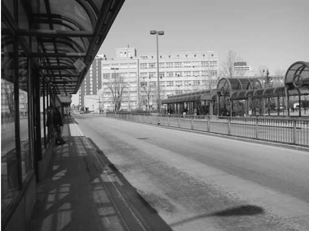
Figure 4. Barrier between opposing directions of travel at Ottawa Transitway station.

alighting of passengers from high-floor vehicles, as shown in Figures 5 and 6. Guided vehicles such as the Irisbus Civic vehicle used in Rouen or buses with drop-down bridges, such as those used in Bogotá, Quito, and Curitiba, are required for floor-to-platform boarding and alighting.