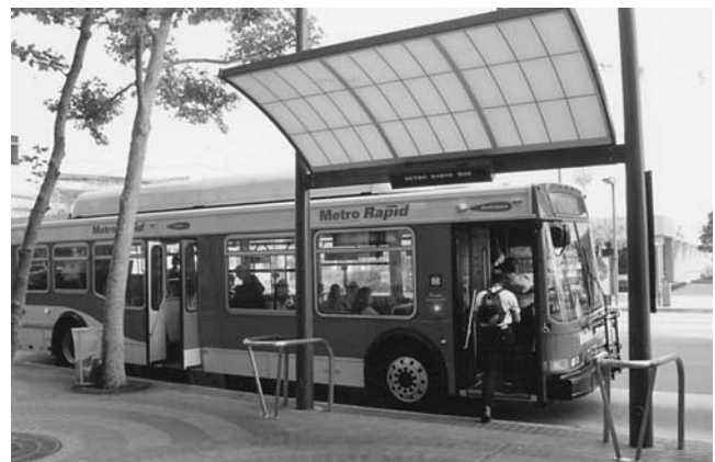
Figure 7. Los Angeles Metro Rapid bus station.

BRT vehicles range from conventional buses to distinctive, dedicated BRT vehicles. Key characteristics of BRT vehicles for selected systems are shown in Table A-6 in Appendix A.