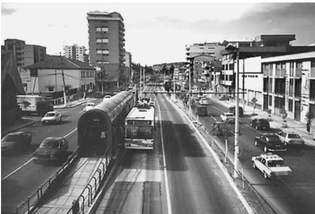
Figure 5. Trolleybus station, Quito.

Design Features. Stations in the case study systems provide a broad spectrum of features and amenities depending on