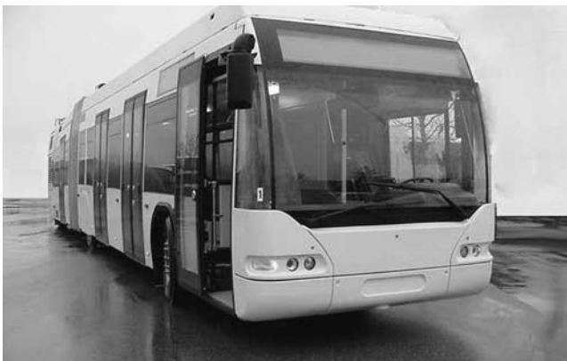
Figure 9. Dual-mode articulated bus.

Propulsion. Standard diesel buses predominate; however, a trend in North America is to use “clean” vehicles such as CNG or hybrid diesel-electric vehicles (as in Los Angeles and Cleveland). Seattle and Boston operate or will operate dual-mode electric trolley and diesel or CNG buses. The Irisbus Cavis vehicle used in Rouen, France, is a “new design” diesel or CNG electric vehicle with train-like features and the ability to be guided. This vehicle is shown in Figure 10.