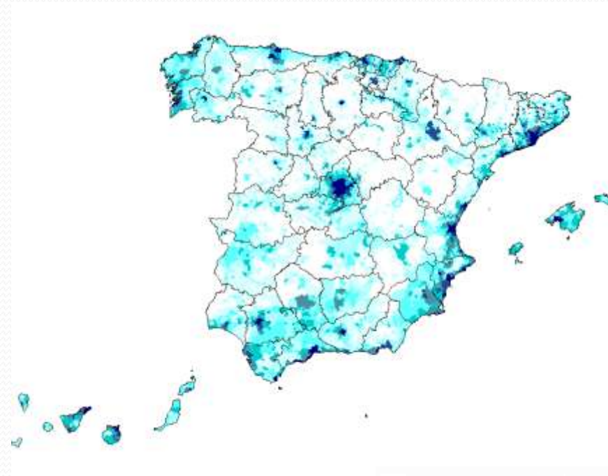
Densidad de población