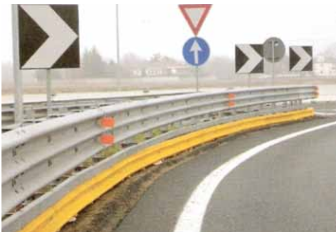
Figure 17. Spanish guardrail that meets motorcycle safety standards.