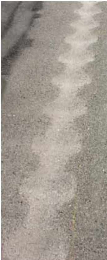
Figure 12. Centerline rumble strips with sinusoidal cut pattern to eliminate sharp edges that pose hazards to motorcyclists.

The team learned that the agencies it visited use the same roadway design philosophy as the United States, with a desire for design consistency within functional class and harmonization of posted speeds with design characteristics. In Europe, as in the United States, specific vehicle sizes and driver eye heights are assumed for roadway design values. The lack of a design motorcycle and rider was noted in several countries visited. Despite these data gaps, federal transportation agencies, European Union-sponsored coalitions, manufacturers' groups, and research institutes have developed the various roadway design guidelines described in this chapter.