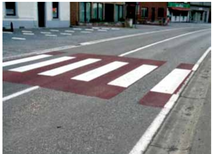
Figure 10. Gap left in crosswalk marking material for motorcyclist to pass through in Belgium.