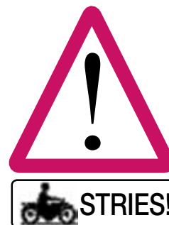
Figure 3. Work zone caution sign in Belgium with supplemental motorcycle plaque warning of grooved pavement (stries = striations).

benefit to motorcyclists because of their relative vulnerability to injury compared to automobile passengers. For instance, the Norwegian maintenance handbook has sections on clearing roadside obstructions that pose crash hazards and limit sight distance. This practice helps all road users, but can particularly benefit motorcyclists. Two unique maintenance practices organized by stakeholder groups were presented that could be adopted in the United States. One was a “road quality ride” organized by a rider group in Belgium, during which local motorcycle clubs ride together on a specific road to inspect and report on pavement quality and pick up debris and litter on the shoulder. The other was a roadway condition reporting system, either phone- or Web-based, aimed specifically at motorcyclists. Implementation of these systems varied from country to country. In Norway, for example, the Motorcyclists Union maintained a reporting