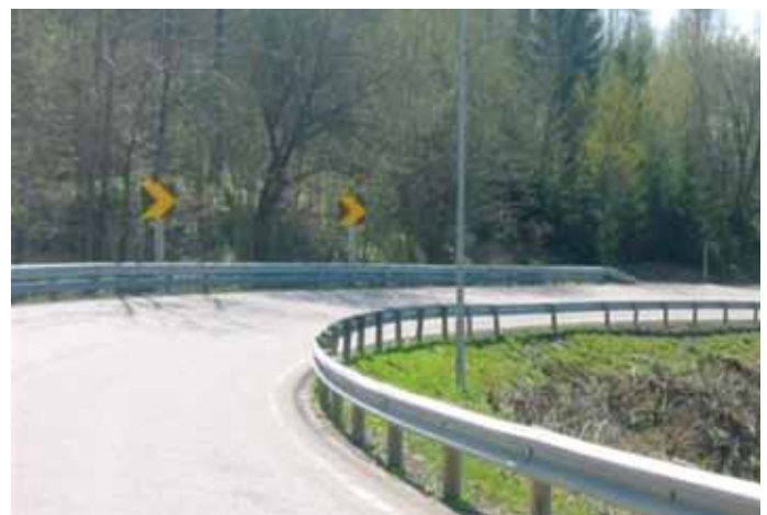
Figure 19. Norwegian Vision Zero Motorcycle Road after brush clearing and installation of motorcycle barrier on outside of curve.