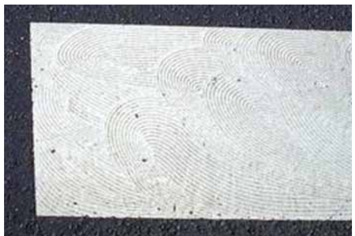
Figure 11. Troweled pavement marking binder material to increase texture and friction.