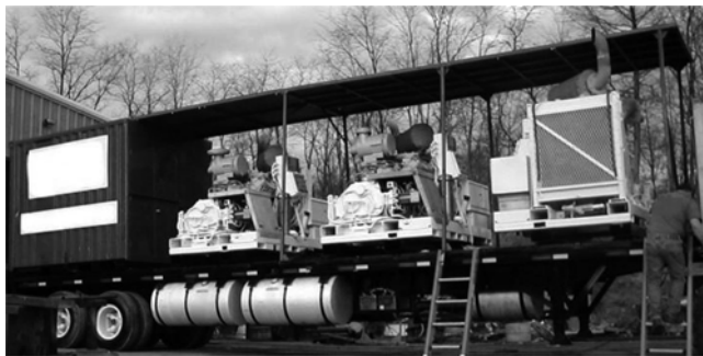
Fig. 4—Hydrodemolition pump trailer.

movement or de-tensioning of the tendons. Sudden release of anchorages or removal of support for the tendon profile could lead to equipment damage, personal injury, or structural integrity loss. Refer to International Concrete Repair Institute’s (ICRI’s) ICRI Technical Guideline No. 310.3, “Guide for the Preparation of Concrete Surfaces Using Hydrodemolition Methods,” for additional information regarding considerations for hydrodemolition use.