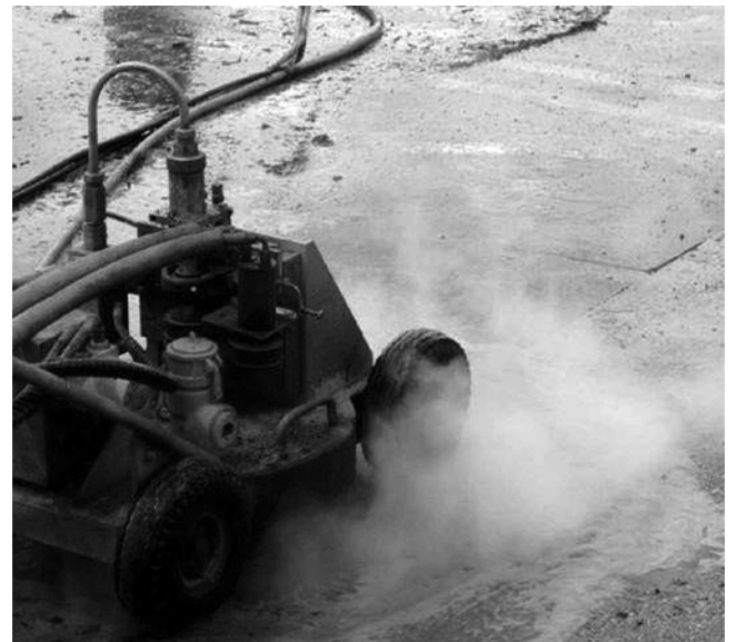
Fig. 6—Hydrodemolition mower.

Hydrodemolition equipment consists of high-pressure pumps (Fig. 4); self-propelled robotic units to hold and maneuver the water jet (Fig. 5); small push or self-propelled units (mowers) used for small removal areas (Fig. 6); and hand lances (Fig. 7). The robotic units move the water jet uniformly over the surface. Where the concrete quality is consistent, the removal will be uniform and result in a finished surface profile amplitude approximately the size of the coarse aggregate. Travel speed of the unit can be adjusted to control the overall amount and depth of removal. The