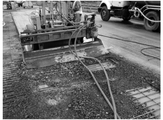
Fig. 5—Hydrodemolition robot.