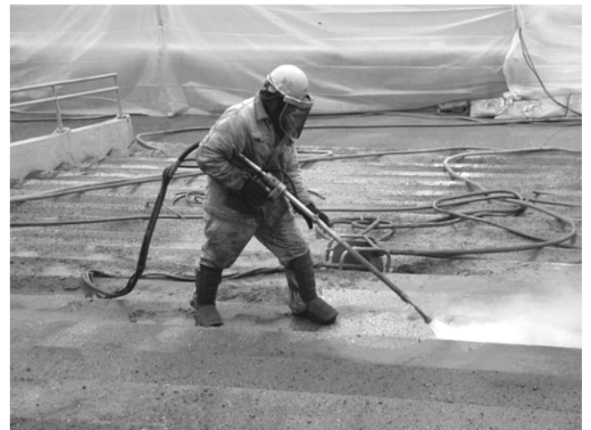
Fig. 7—Hand lance for hand-held hydrodemolition