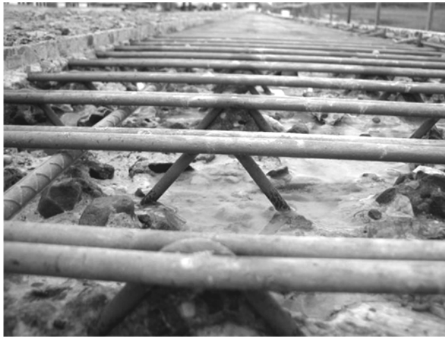
Fig. 3—Reinforcing steel and bar joist top chords exposed using hydrodemolition.